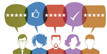
IMPROVE SOCIAL MEDIA & ONLINE REVIEWS